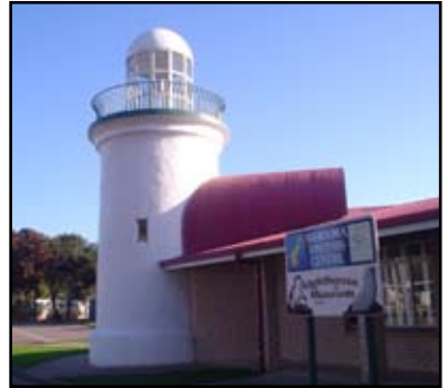
Narooma Visitors Centre