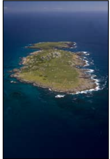
Montague Island from the north

This is a general guide only. You may have special needs or your group may require additional information.