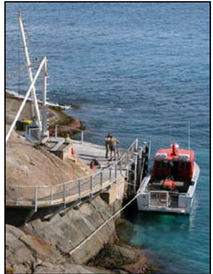
Montague Island's jetty